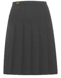
Yr 7* from Sept. 2026

Tight skirts, tight trousers, jeans or leggings are not permitted.