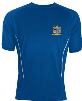
PE Training Top* (only available from our College supplier) Royal Blue training top with college crest

Trainers for PE should be supportive and as plain as possible in any colour with non-marking soles as they will be worn in the Sports Hall.