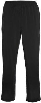
Tracksuit Trousers (can be purchased from any supplier)