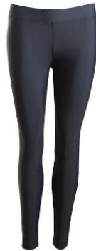
Female Leggings (can be purchased from any supplier)